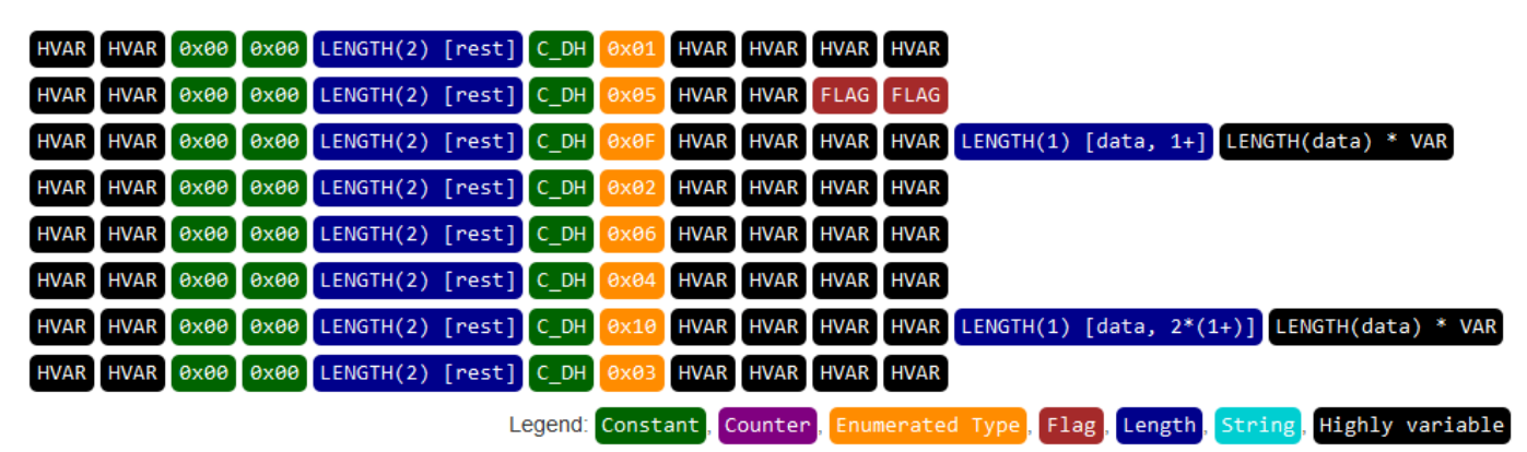
Figure 3. A model of Modbus requests, built based on the true specification. To be interpreted in the same way as Figure 2.