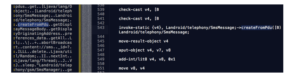
Fig. 2. Comparison of the dumped dex file with the original dex file of the application.

Dumping memory. Dumping specific parts of the memory can give us back the Dalvik executable (dex) of the analysed application. It contains Dalvik byte code which is readable for humans as well. Further analysis of this dex file can reveal important informations about the behaviour of the program. Figure 2. shows a comparison of the dumped dex file with original dex file of the application.